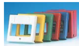
RANGE OF CASING COLOURS White, Yellow, Green, Red, Blue

DEMCO INDUSTRIES SDN BHD www.demcoalarm.com